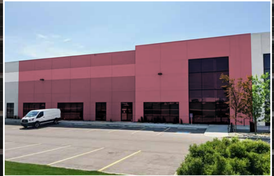
AIRPORT CROSSING WAREHOUSE 10221 15 STREET NE